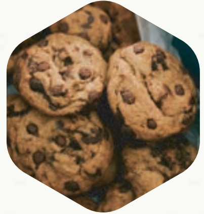
Cookies Production Line