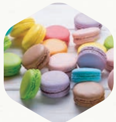
Special Product Solution