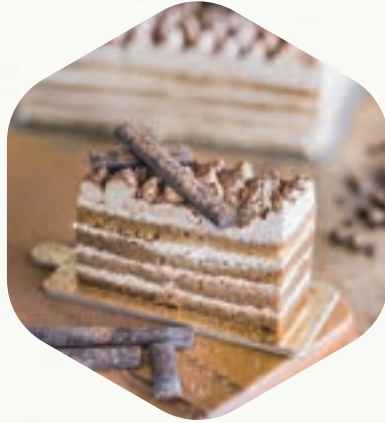
Cake Production Line