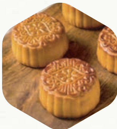
Mooncake Production Line