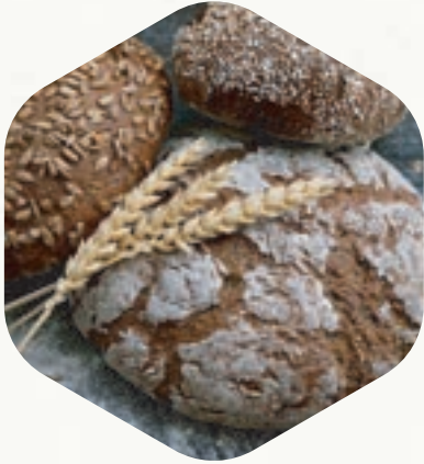
Bread Production Line